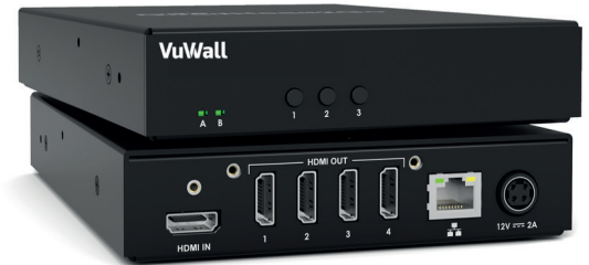
AdScape 4K Expander

Plug and play with default output arrangement of 2x2 set for the most common scenarios. Output arrangement can be set from the front panel to additional simple arrangements: 2x1, 1x2, 2x2, 3x1, 1x3, 4x1, 1x4 in both portrait and landscape. Manage multiple Adscape units over the network with the AdScape Configurator software to customize output arrangements in mixed resolutions and bezel management.